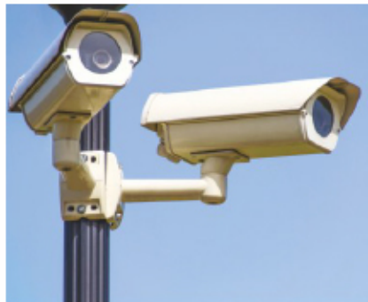
4X6 CCTV Surveillance