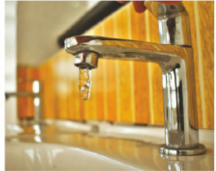
Manjeera Water Provision