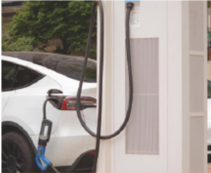
EV Charging Point