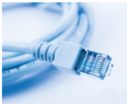
Concealed Internet Cable