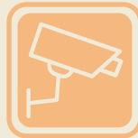
4X6 CCTV Surveillance