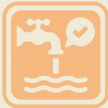
Manjeera Water Provision