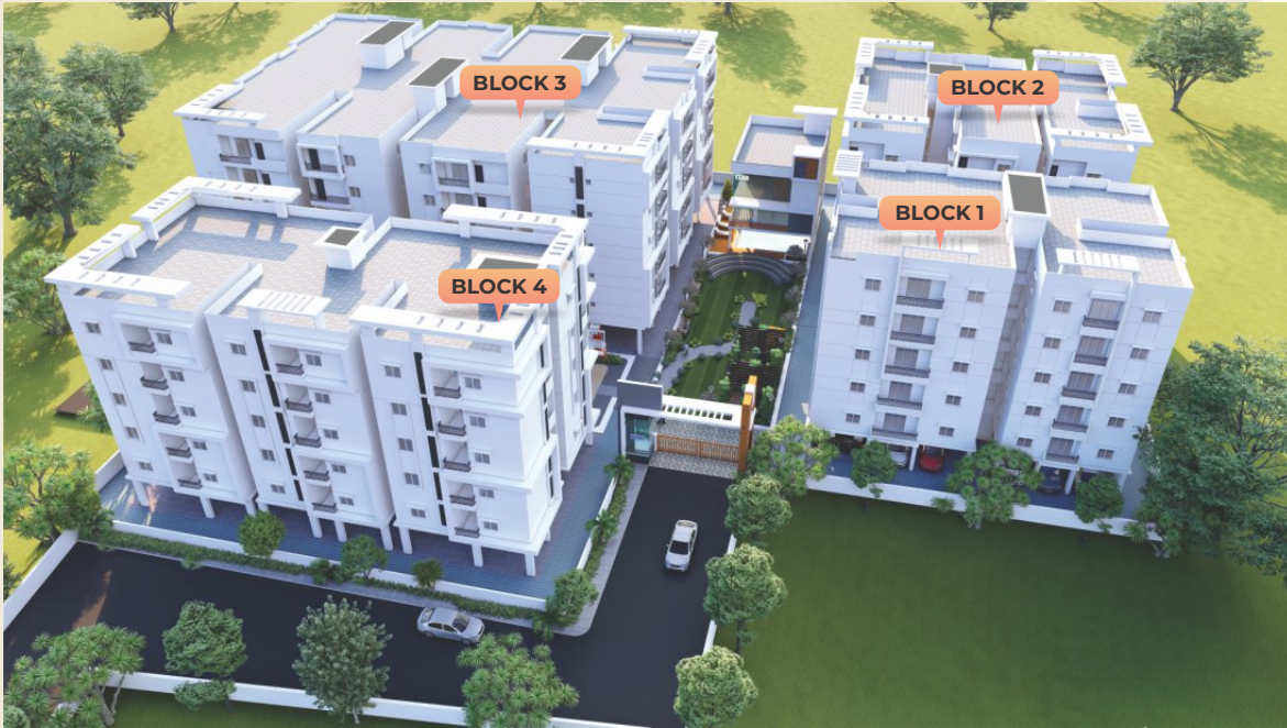
Vilaasam @ Ameenpur